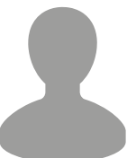
Vacant Director of Health Protection and Commissioning (Deputy DPH).