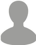
Vacant Executive Director of Resources and Transformation.