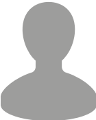
Vacant Executive Director of Resources and Transformation.

Housing strategy and policy, assets and delivery, contract management, housing needs and homelessness, supported housing and housing transformations.